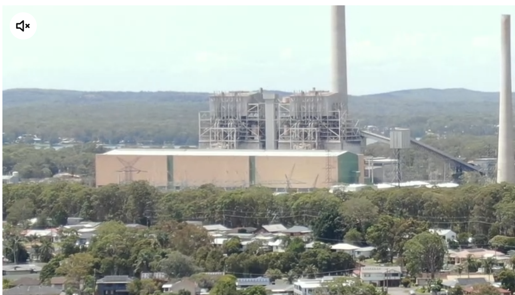
Drone footage of Vales Point, Wyee Bay. Video: Hunter Community Environment Centre

Frustrated southern Lake Macquarie residents say they are gravely concerned about the waterway's health six months on from two mass fish kills.