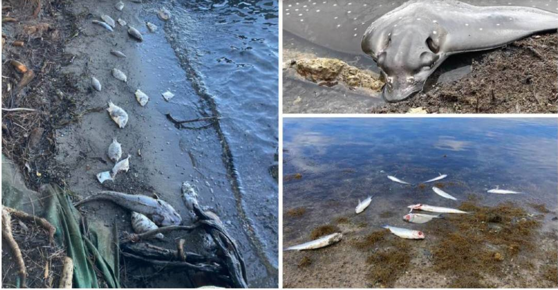
📷 Mannering Park Fish Kill.

A Delta Electricity spokesman said the company was cooperating fully with the investigation.