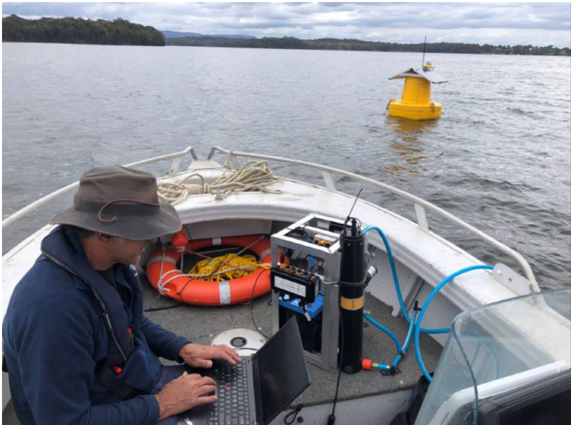
📷 An research officer reads data from a smart buoy that was deployed off Wyee Point following the second fish kill. Picture supplied.

Previous surveys have shown that seagrass in Wyee Bay has all but disappeared due to excessive thermal pollution.