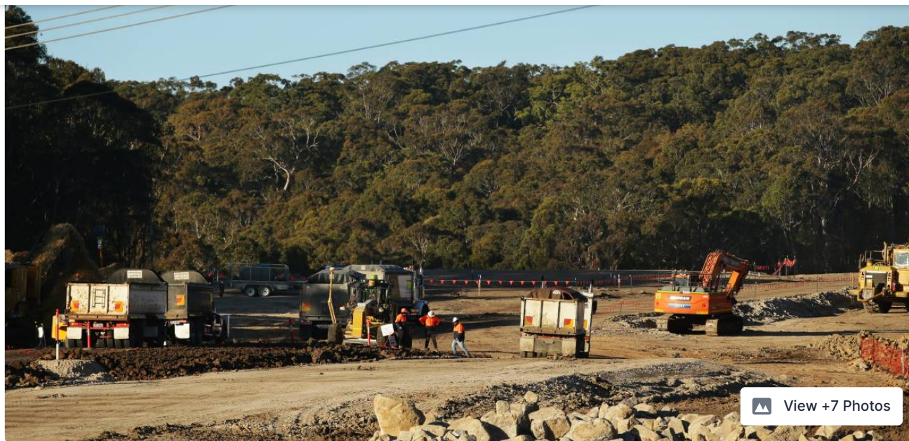
Newcastle Inner City Bypass construction