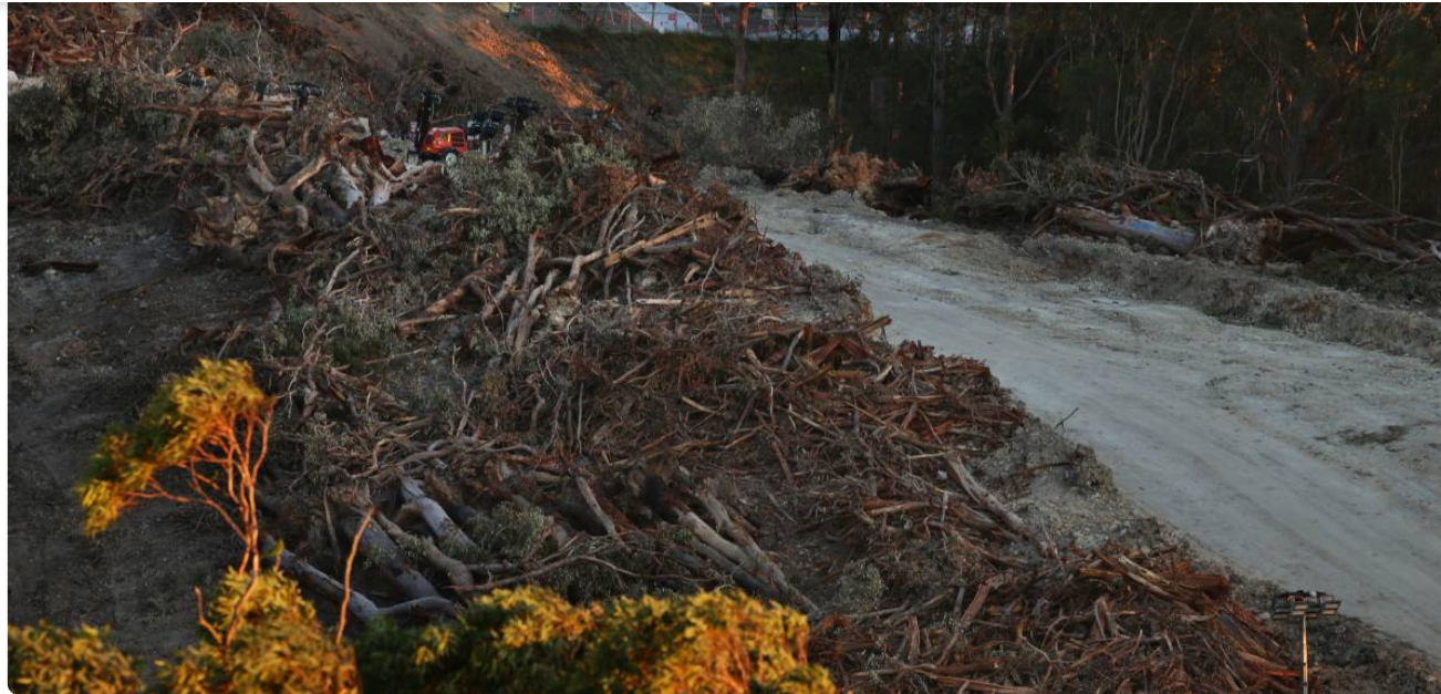
📷 "Nothing short of shameful": the environmental cost of Newcastle's Inner City Bypass

"We hope that the flagrant destruction of land clearing being on full display serves as a wake up call to the broader community that we must put a stop to the clearing of species habitat now, if we want the next generation to know the joy and the wonder that so many derived from Jesmond bush."