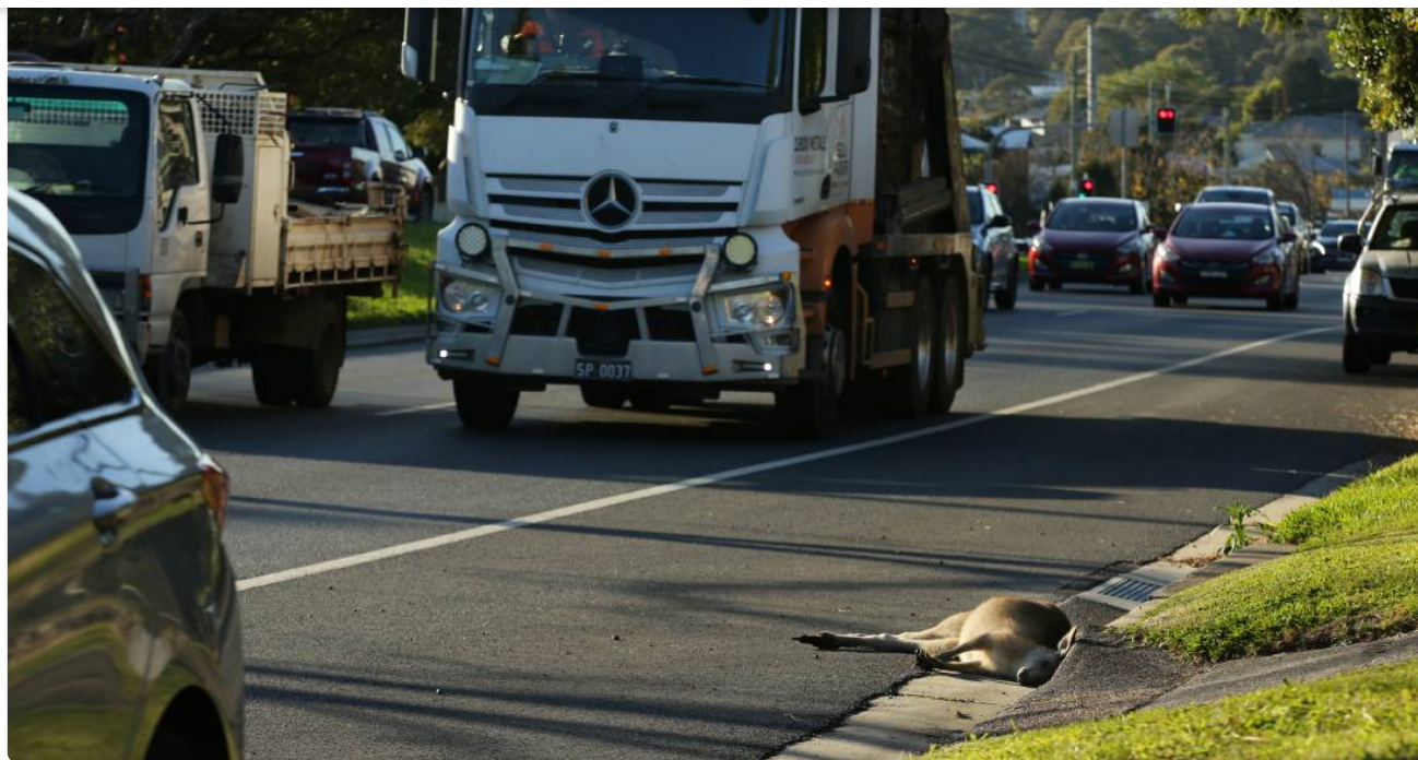
📷 The dead kangaroo on the side of Newcastle Road, Jesmond.

An environmental expert has disputed a Transport for NSW assertion that a dead kangaroo found 1.3 kilometres away from the Newcastle Inner City Bypass construction site at Jesmond was unlikely to have been displaced by the project.